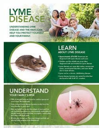
Lyme Disease Trifold Brochure