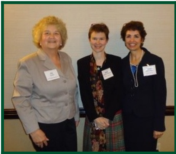
Environmental Protection Agency, Arlington, VA