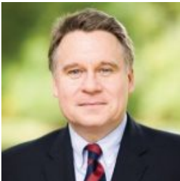
Congressman Christopher H. Smith (NJ-04)

July 23, 2020: The House voted this week to pass a number of amendments to the NDAA, National Defense Authorization Act, including a Chris Smith/Collin Peterson amendment, # 587 –The Comptroller General of the United States shall conduct a review of whether the Department of Defense experimented with ticks, other insects, airborne releases of tick-borne bacteria, viruses, pathogens, or any other tick-borne agents regarding use as a biological weapon between the years of 1950 and 1977. ( https://rules.house.gov/bill/116/hr-6395 ).