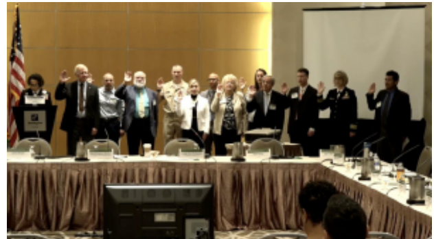
Swearing in of the HHS TBDWG members, June 4, 2019.

solicited, but will be selected by the prospective co-chairs for each of the 7 subcommittees determined at the meeting.