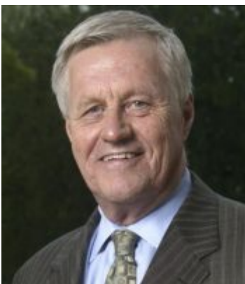
Rep. Collin Peterson