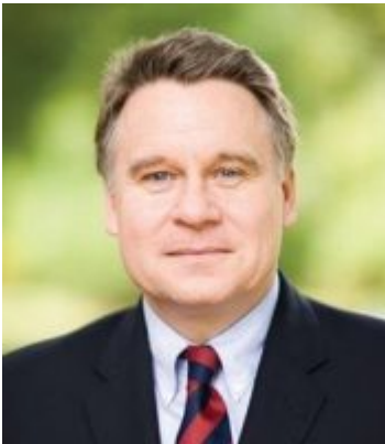
Rep. Chris Smith