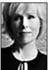
E Jean Carroll

Meg Cabot #1 New York Times best selling author whose works include The Princess Diaries series, which were made into two hit movies http://www.megcabot.com